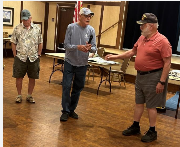
New Members are Welcomed during the Meeting